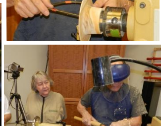
Making a mini-cowboy hat.