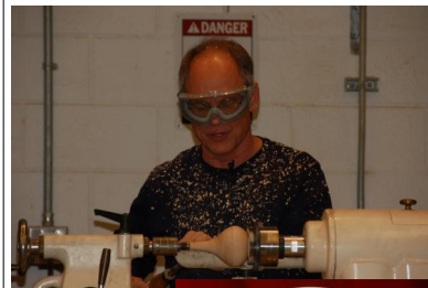
Small bud vase and turned disk