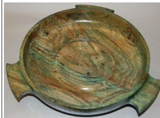
Moss covered 3 handle Gredunza—George Daughtry