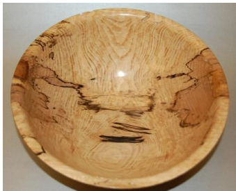
Spalted Beech bowl, lots of figure—Bill Graves