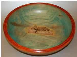
Large dyed bowl with intricate carvings inside and out—Jim Hutchinson