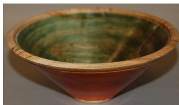
Small maple bowl dyed green—George Daughtry