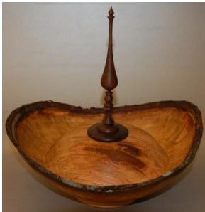
Cherry natural edge vessel with Walnut finial—Paul Telenko

The January meeting found our members bringing a variety of excellent work, as usual. Enjoy the photos below.