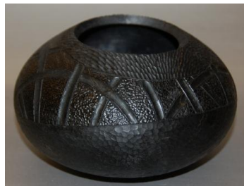
Cherry vase, ebonized with leather dye and carved—Roman Stankus