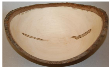
Natural edge Ambrosia Maple bowl—Kevin Woods