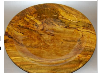
Silver Maple platter, dyed yellow—Doug McCulloch