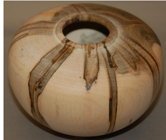
2 nice Ambrosia Maple vases—Kevin Woods