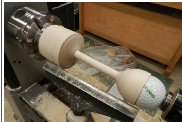
Making a spiral stem goblet.