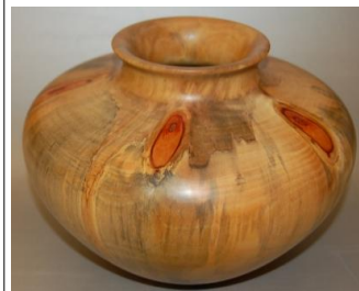
Norfolk Island Pine vase—Doug McCulloch