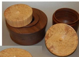
Small Walnut boxes with Pecan lids—Jim Hutchin-son