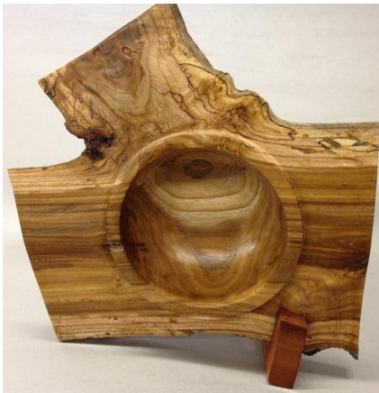
Red Bud Crotch bowl—Mike Peace