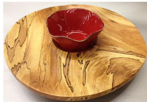
Spalted Elm "snack" platter with ceramic dip bowl in center—Doug McCulloch