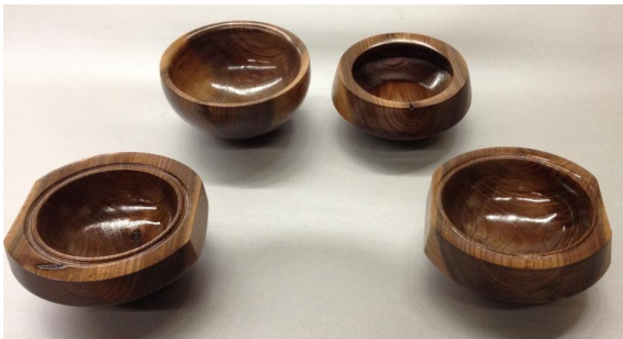
Three small Walnut bowls, finished with Lacquer—George Daughtry