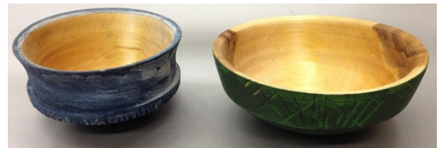
Three small turned, carved and painted birch bowls—Merideth Bridges