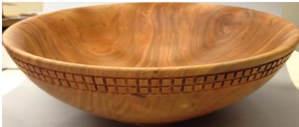
Very large Cherry bowl with carved pattern on outside rim —Wes Jones